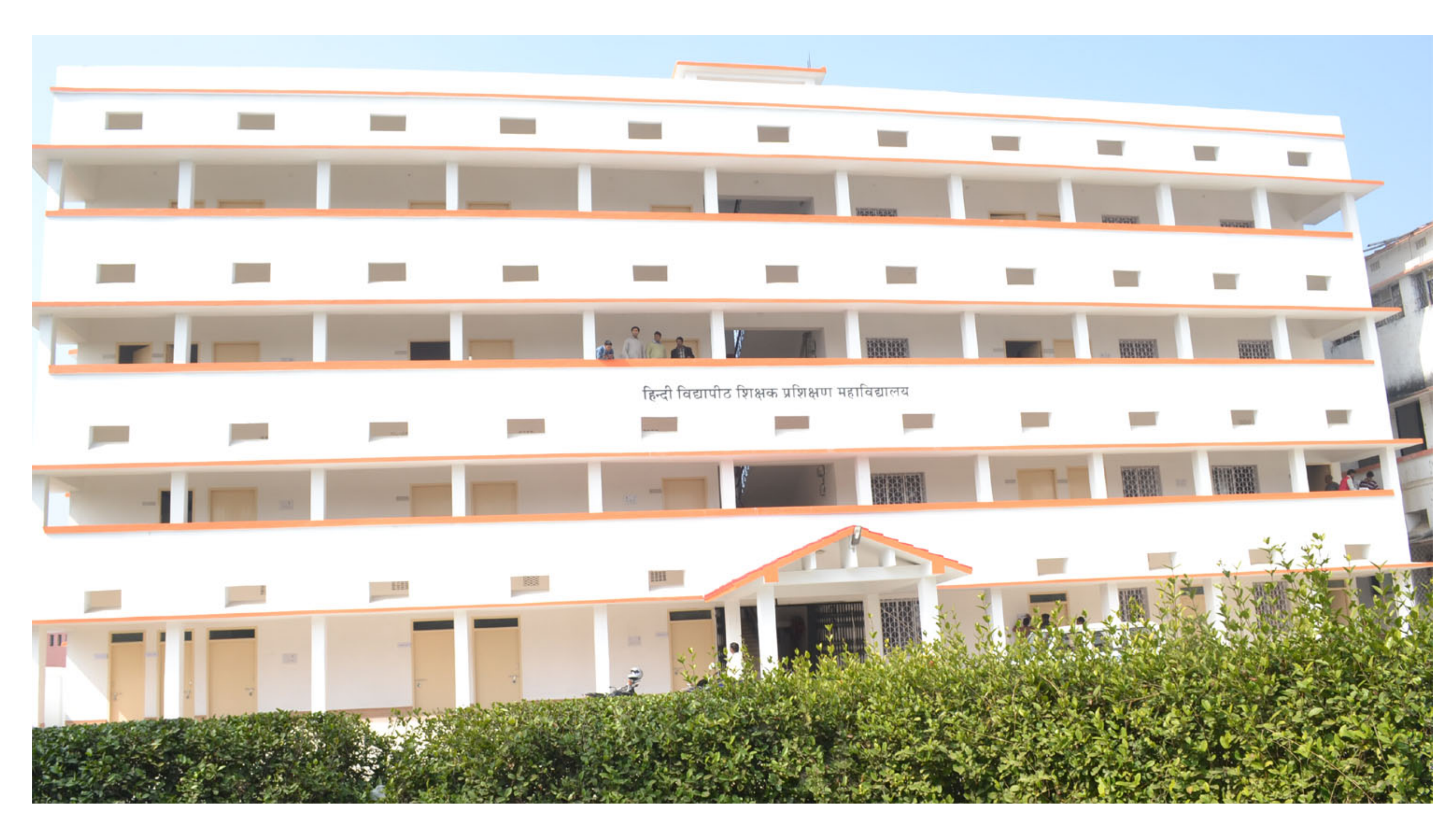
Jharkhand News In Hindi Deoghar